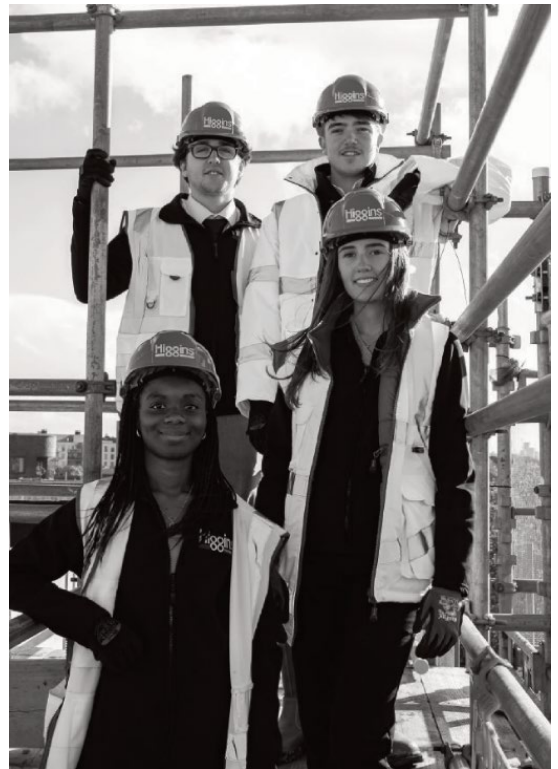
Above image: Higgins' Management Trainee Programme 2022 cohort

If you are interested in any of these opportunities, please enquire by contacting us via: CSR@higginspartnerships.co.uk