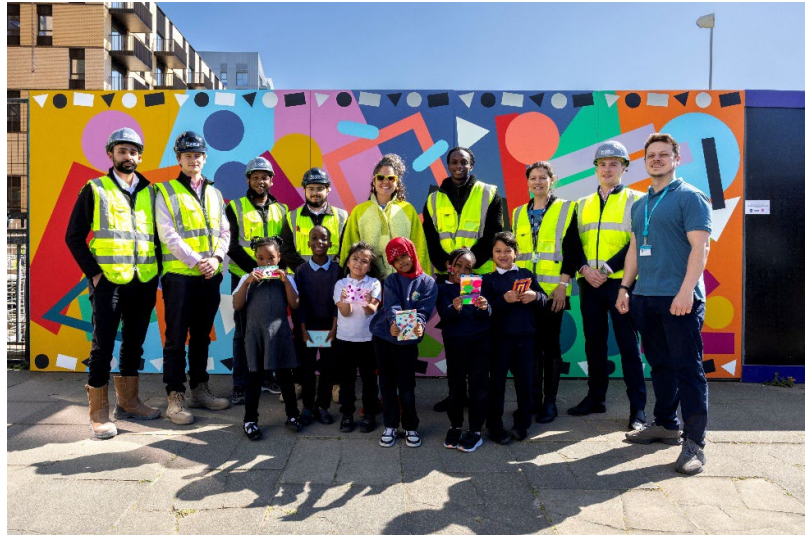
Hoarding Artwork Project unveiling event at our Lewisham project

We will also engage with local schools and training centres such as Rhyl Community Primary School, Haverstock School and the Euston Skills Centre where we will support with curriculum or skills-based learning.