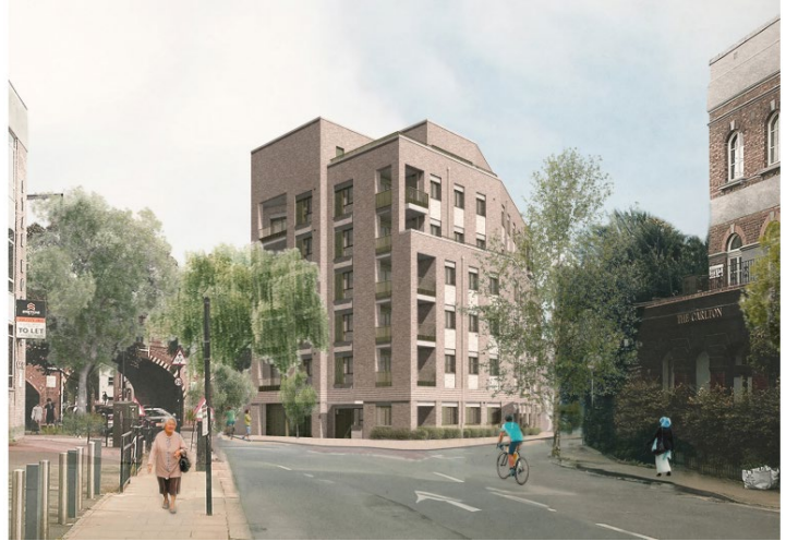
Visualisation of block D1

We will keep you regularly updated on the build progress and we will provide updates on any community engagement activities planned.