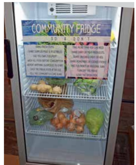
Fruit and vegetables sit in the community fridge in West Hampstead

Find out more by calling 020 7625 1184 , or email hello@thesherriffcentre.co.uk or visit thesherriffcentre.co.uk