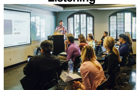
For Entry 2 to Entry 3 Learners