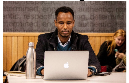
For Entry 2 to Entry 3 Learners