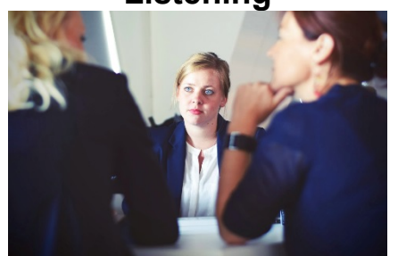
For Entry 3 to Level 1 Learners