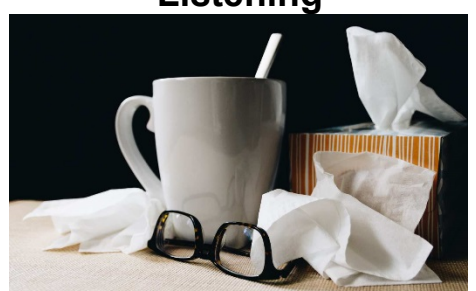
For Entry 1 Learners