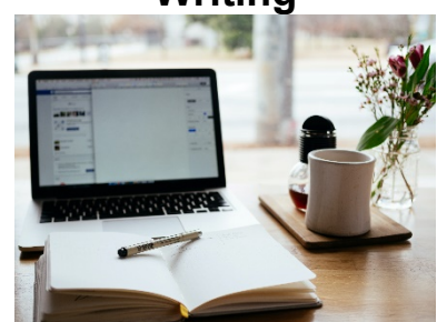
For Level 1 to Level 2 Learners