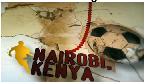
For Entry 1 to Entry 2 Learners

CAMDEN 020 7974 1618 esol@camden.gov.uk www.camden.gov.uk/esol