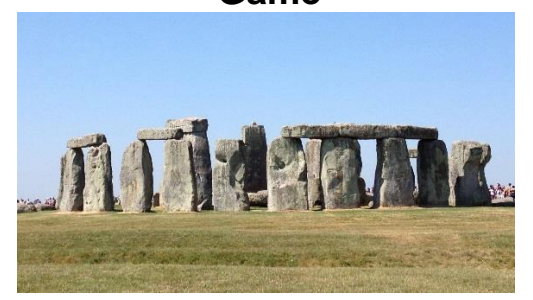
For Pre-Entry to Entry 1 Learners