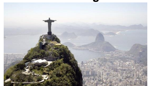
For Level 1 to Level 2 Learners