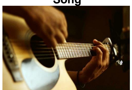
For Pre-Entry to Entry 1 Learners