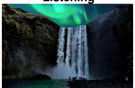
For Entry 3 to Level 1 Learners

CAMDEN 020 7974 1618 esol@camden.gov.uk www.camden.gov.uk/esol