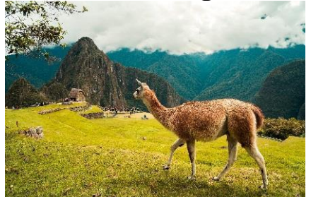
For Entry 3 to Level 1 Learners