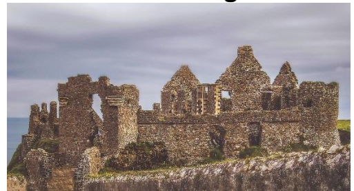
For Level 1 to Level 2 Learners