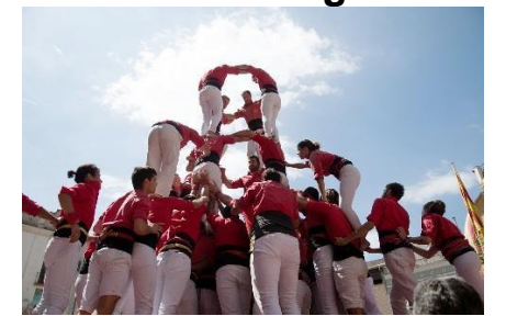
For Entry 1 to Entry 2 Learners