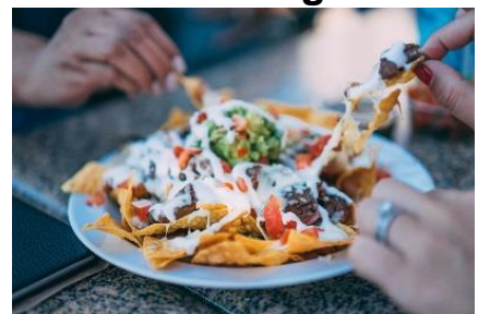
For Entry 2 to Entry 3 Learners