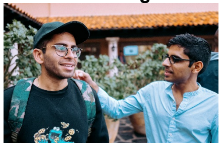
For Level 1 to Level 2 Learners