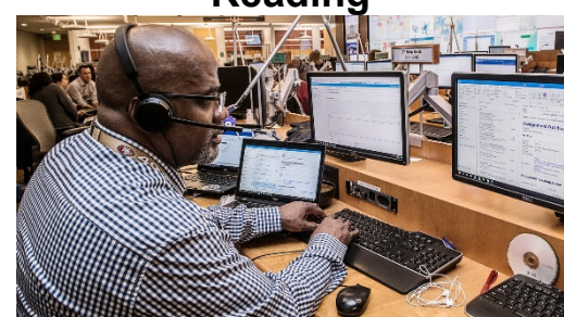
For Level 1 to Level 2 Learners