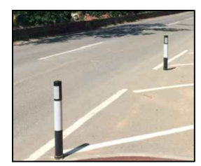
● New Jison pole @ 800mm x40