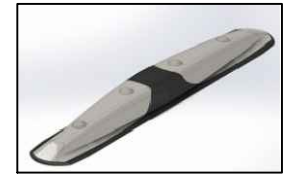
▬ New mini-orca x4