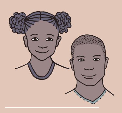
Schools and education , including the digital divide