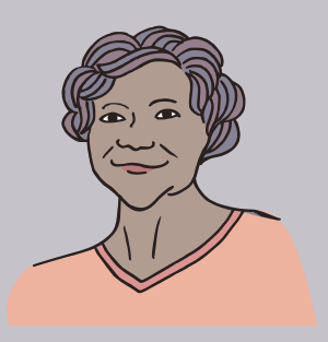
The experiences of our most vulnerable residents – shielding people and Adult Social Care clients