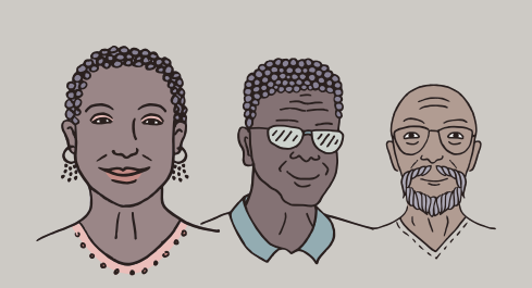
Understanding the lived experiences of people from Black, Asian and other ethnic backgrounds

The six areas in scope of the working group's review included: