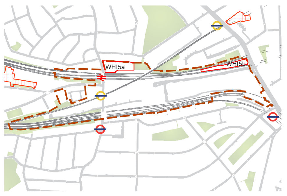
Figure 9.6: Other Development Sites table