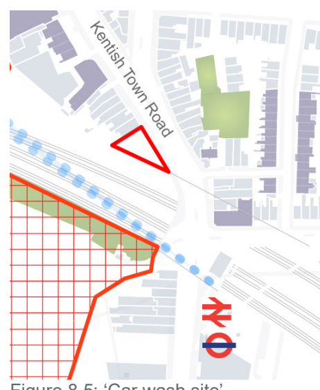
Figure 8.5: 'Car wash site'

8.60 The Council's aspirations for the Kentish Town area include the provision of an attractive pedestrian and cycle route to link Kentish Town Station to Hampstead Heath through the Murphy site. The redevelopment