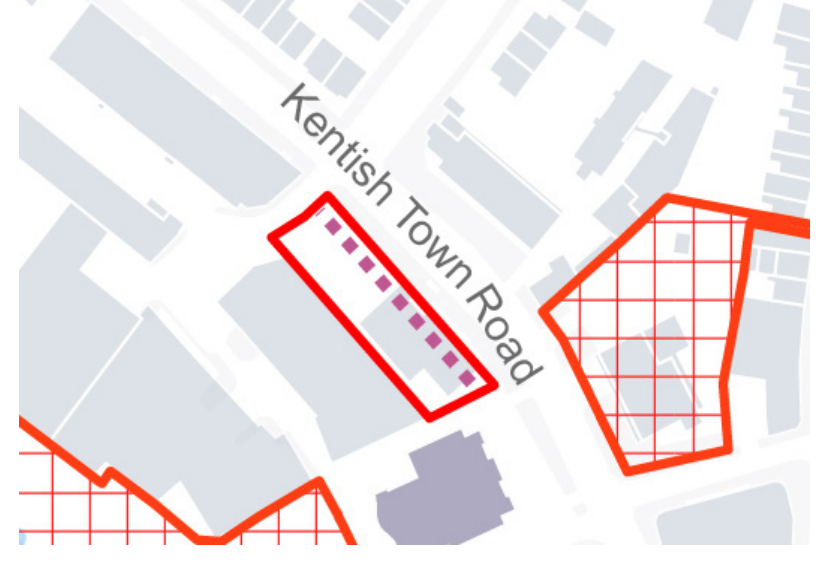
Figure 8.7: Highgate Centre

8.70 This site consists of the Council-owned Highgate Centre at 19-37 Highgate Road. The community/healthcare service previously provided in the Centre has been relocated to the Greenwood Centre for Independent Living located nearby.