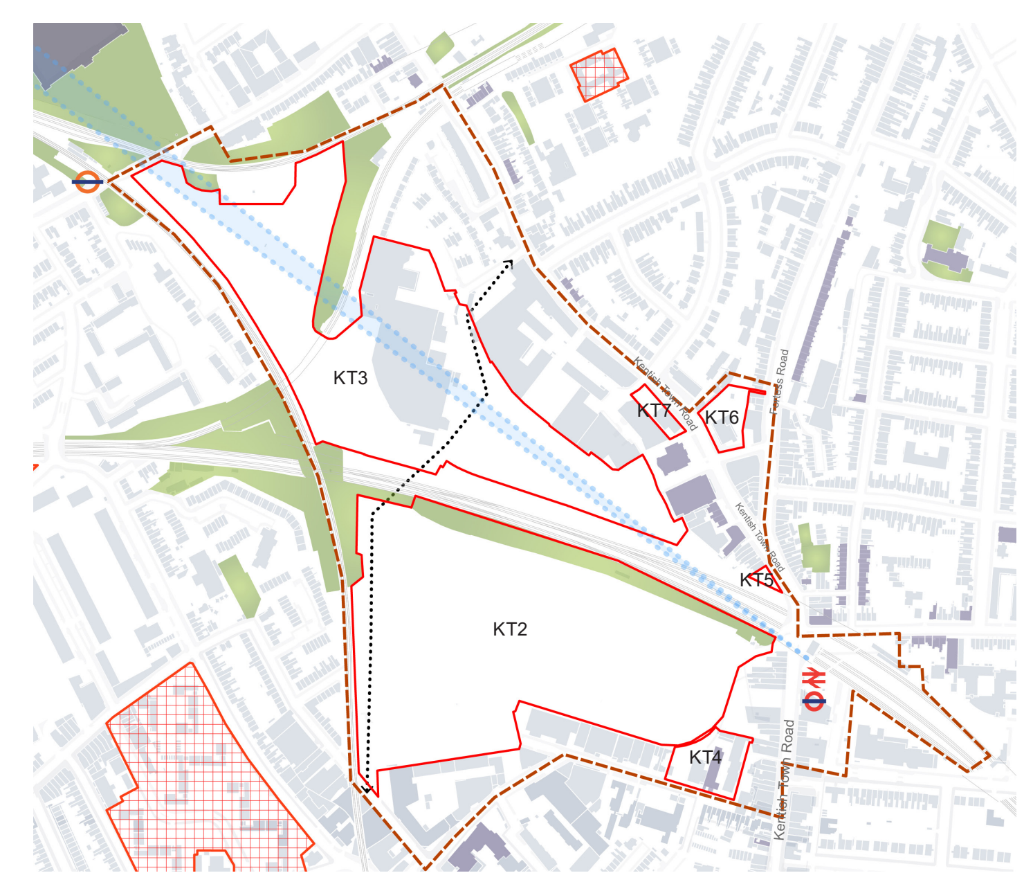
Figure 8.1: Kentish Town Area

8.3 The Kentish Town Area is also covered by two Neighbourhood Areas for which local communities have prepared neighbourhood plans. Broadly, the southern part of the area falls within the Kentish Town neighbourhood area, while the northern part lies within the Dartmouth Park neighbourhood area.