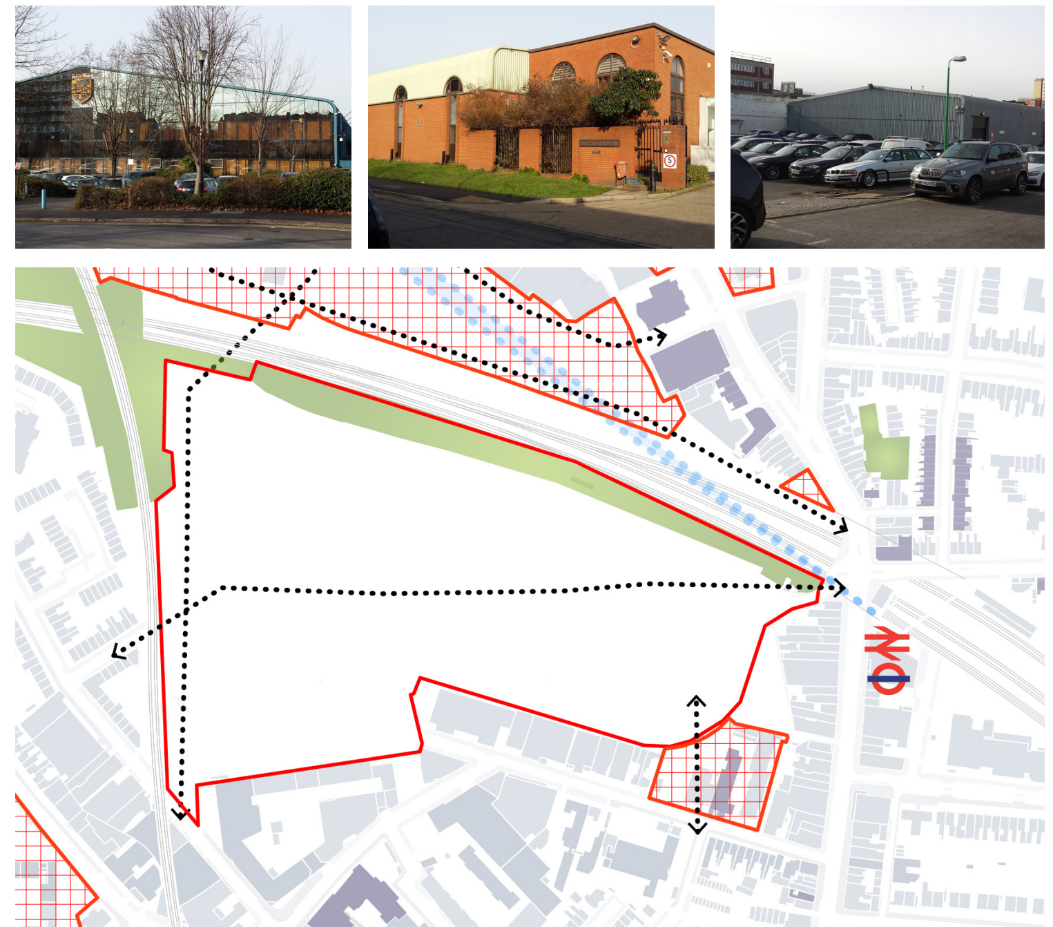
Figure 8.2: Regis Road Growth Area

8.23 Employment densities within the area are relatively low and the comprehensive redevelopment of the area provides the opportunity to intensify employment use, increasing the range of business premises and sectors on site and providing significant additional jobs.