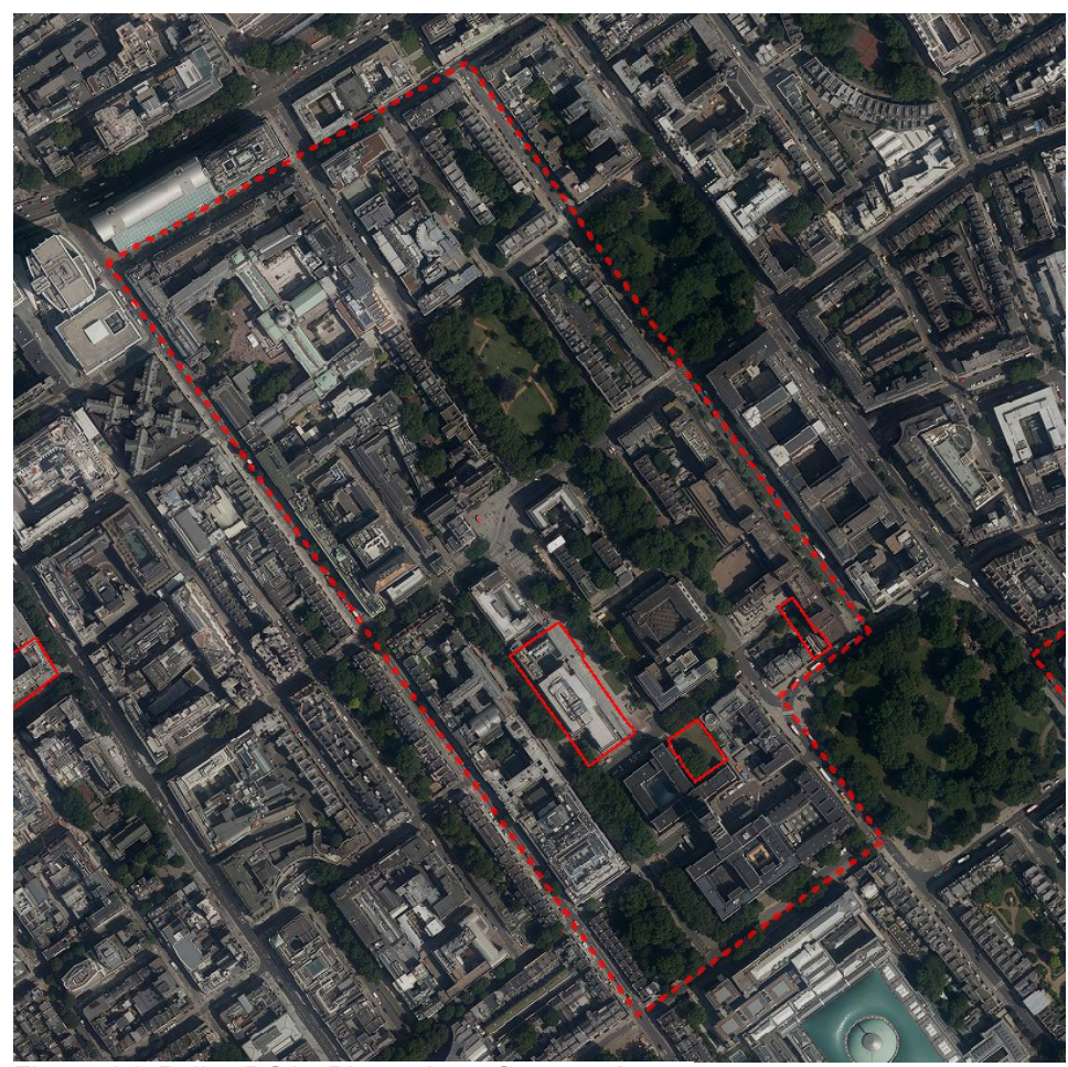
Figure 4.1: Policy BC1 - Bloomsbury Campus Area

4.2 The University provision in the Campus Area is complemented by many higher education institutions and facilities in other parts of the borough, such as the Royal Veterinary College and Central St Martins (University of the Arts),