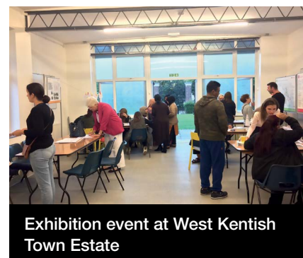
Exhibition event at West Kentish Town Estate

The regeneration of Gospel Oak and Haverstock is part of the Community Investment Programme. As with any project delivered through the programme, local needs come first, which is why we're working with residents from design to delivery.