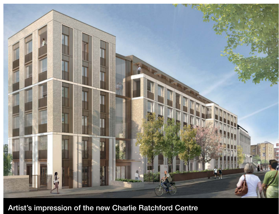
Artist's impression of the new Charlie Ratchford Centre

In early 2019, construction will start on 38 new extra-care homes in Chalk Farm for older people who need support to live independently. The new Charlie Ratchford Centre will be the first extra-care council