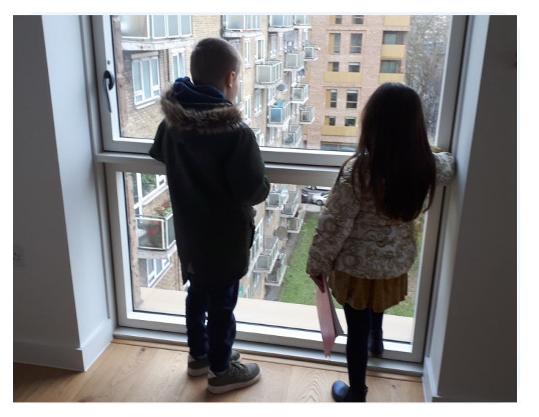
Estate residents looking inside and outside new build homes at Regents Park