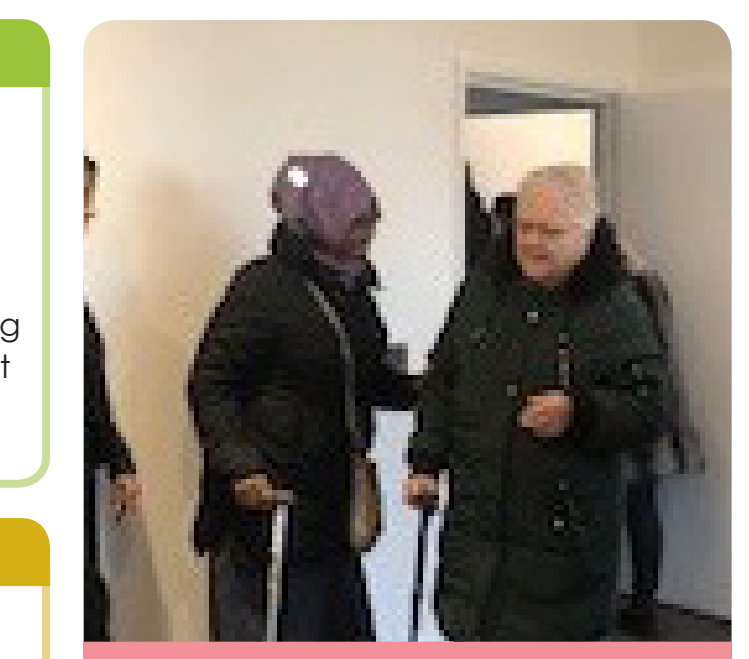
Neighbours viewing new homes together on recent site visit