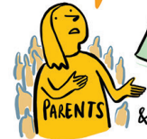
PARENTS & RESEARCH FINDINGS

I feel vulnerable and uncomfortable in child protection conferences